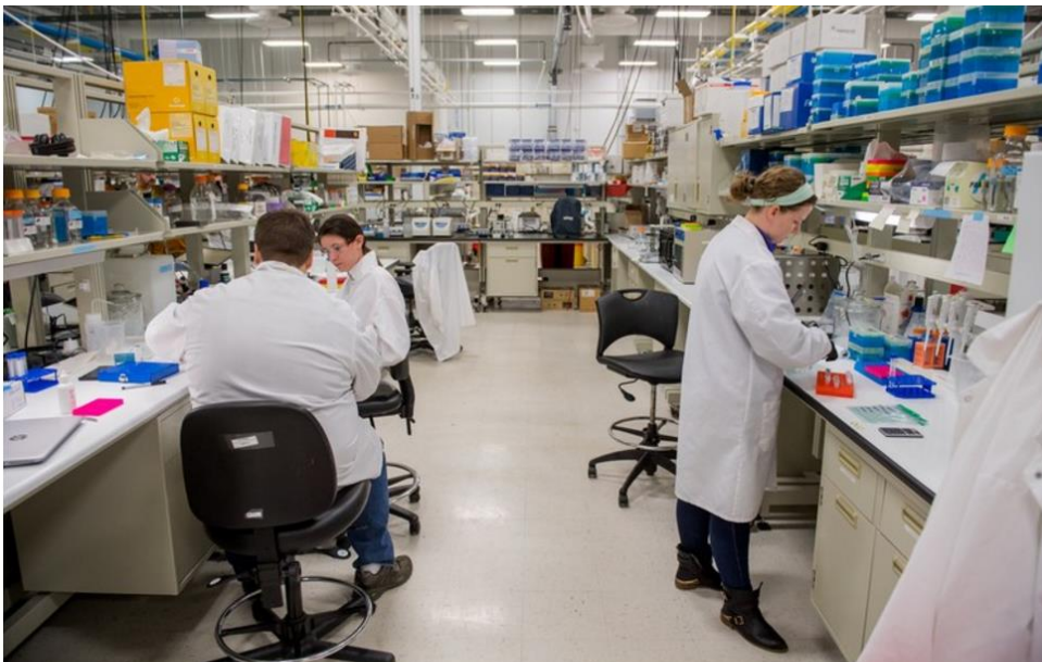
Technicians at work at the Sanford Research Lab in Sioux Falls, which was funded in part by donations from billionaire T. Denny Sanford.

The nonprofit’s medical research facility has taken over a former chip-making facility. Inside, researchers in white lab coats are doing groundbreaking work in rare children’s diseases like Battens disease, a neurodegenerative disorder, and Type 1 diabetes.