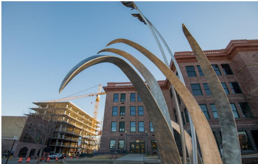
Construction continues on the Washington Square building next to the Washington Pavilion in downtown Sioux Falls earlier this month.